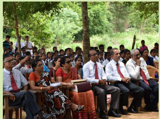
A section of the participants with JASTECA officials