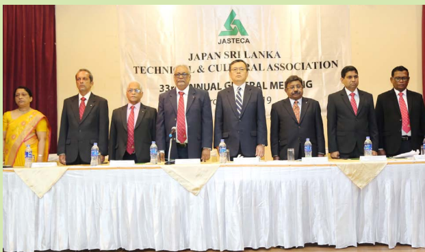
The Head Table