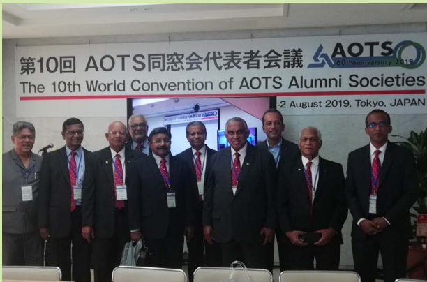
JASTECA delegation at the 10th World Convention of AOTS Alumni Society