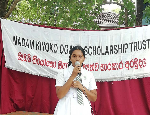
Vote of thanks by a scholarship recipient