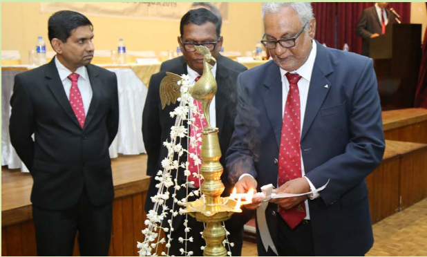
Lighting of the traditional oil lamp