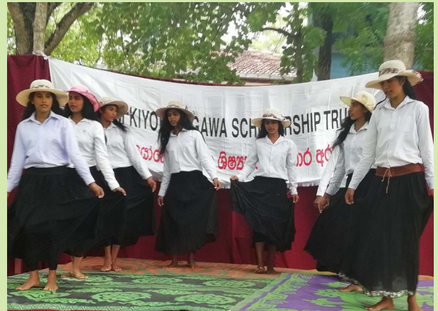
A dance recital by the students