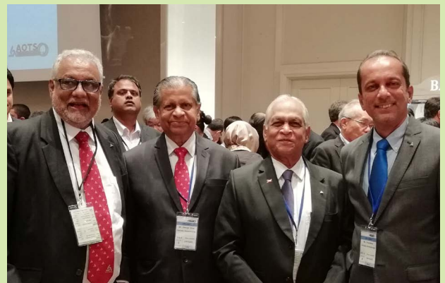
JASTECA members at the banquet