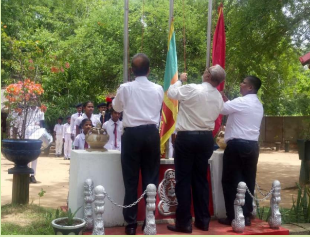
Flag hoisting ceremony