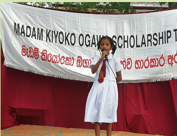
A performance by a student