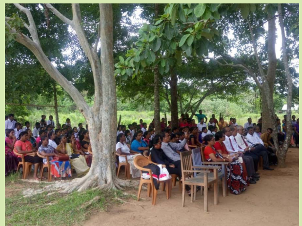
A section of students and parents