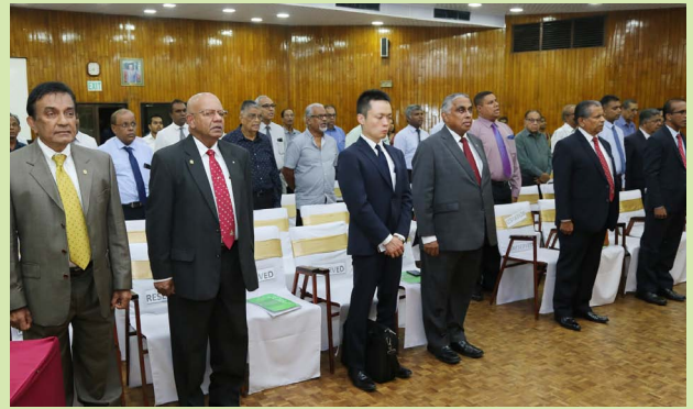
Members at the Annual General Meeting