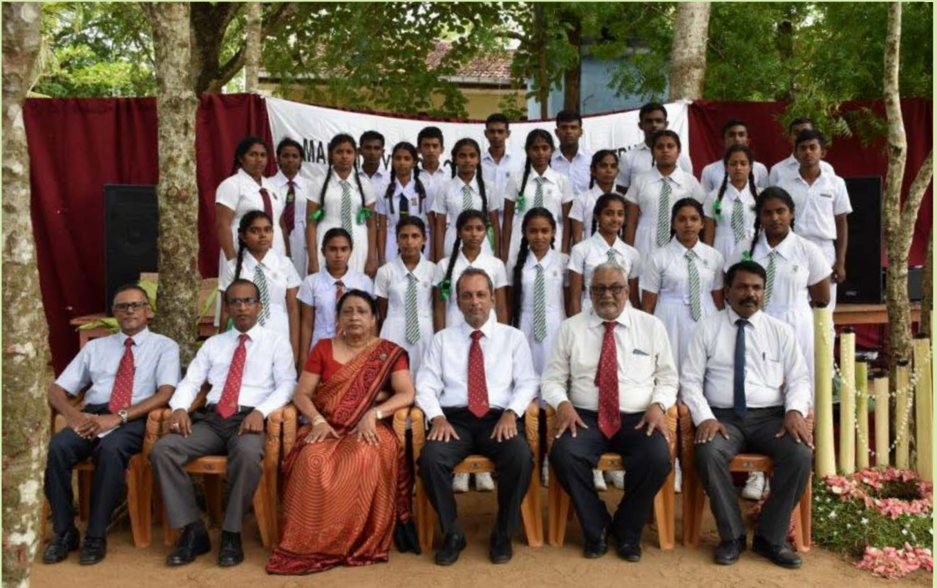
JASTECA executive committee members and scholarship recipients